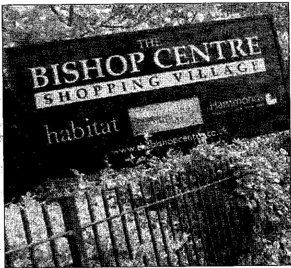
HOT TOPIC: Neighbouring Maidenhead is determined to block the Bishop Centre plans. Ref:110433-4

Districts .... 33 Letters .... 38 The Zone .... 41 Property .... 61 Classifieds .. 95 Jobs ..... 104 Motors .... 109 Sport ..... 128 Full index on P2